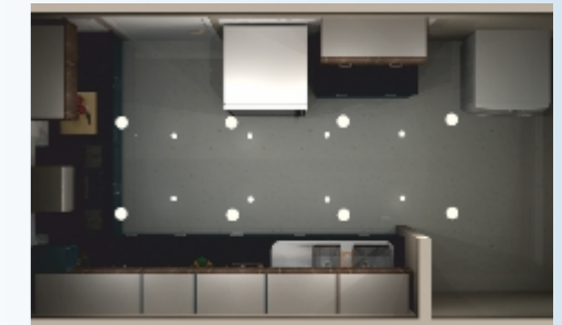
Rendered Plan - Top View

which help you visualize your new kitchen better