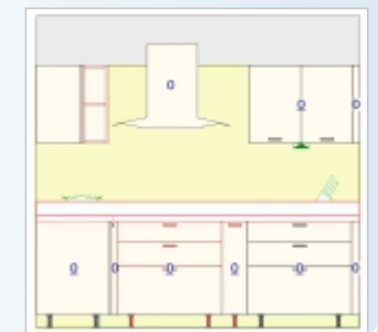
Front View Elevation