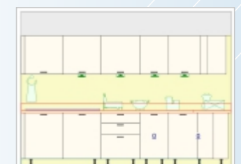
Side View Elevation