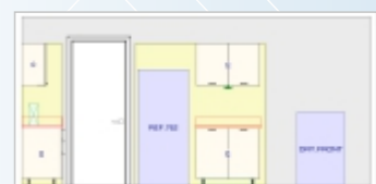
Side View Elevation